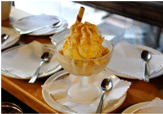
144 cup of ice cream with brittle and advocaat