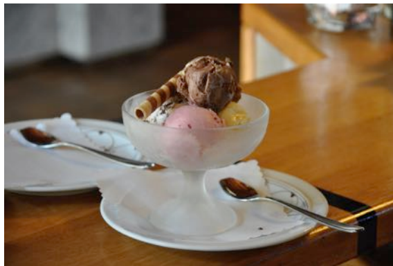
141 mixed ice cream