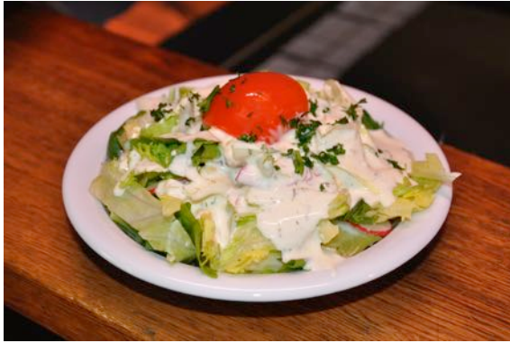
91 salad of the day