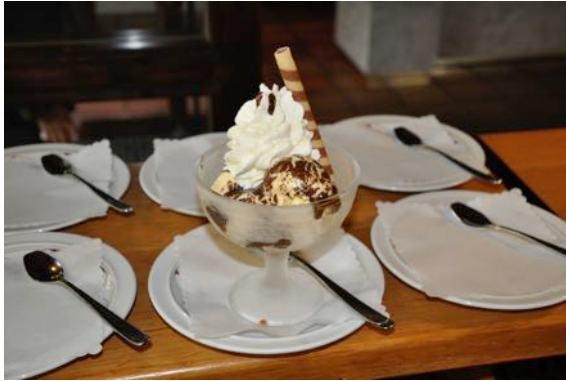
147 vanilla ice cream with hot chocolate