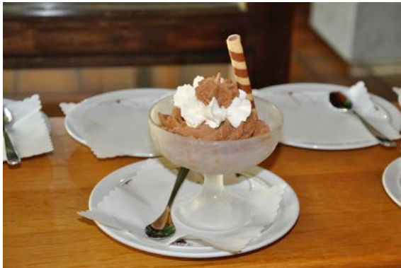
152 mousse au chocolat, ice cream, whipped cream