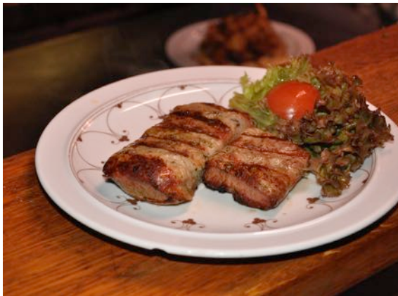
51 saddle of lamb, (200 g)