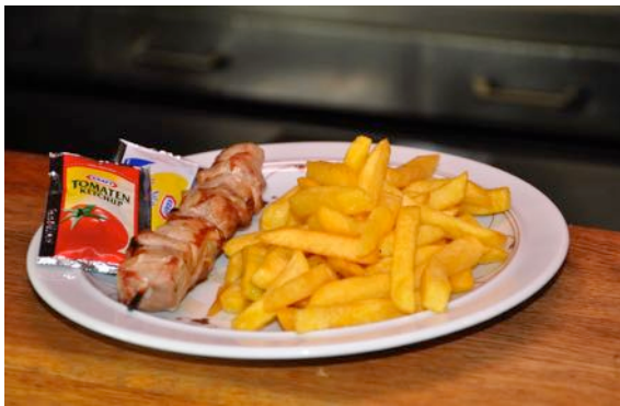
2 spit with filet of pork