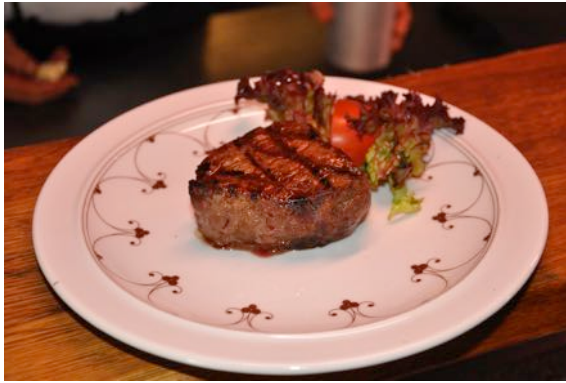
63 fillet steak (200 g)