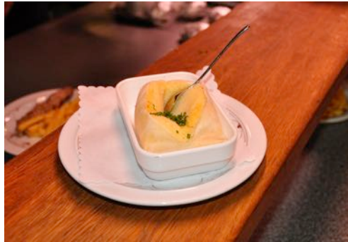
76 bag of potato