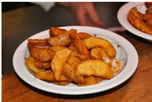
74 potato wedges