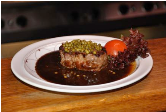
65 fillet steak (200 g) with sauce of your choice