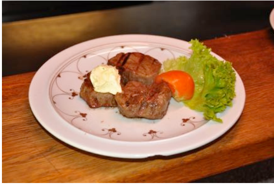
40 "spit" from fillet (200 g)