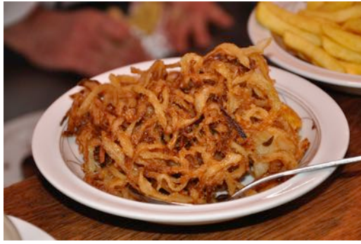
75 fried onions