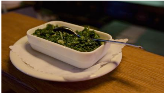
88 spinach with garlic and onions