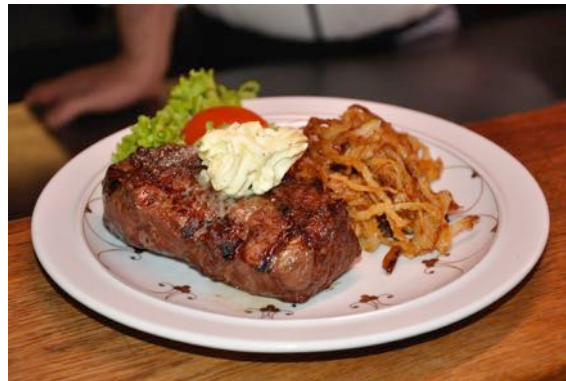
62 rumpsteak (300 g)