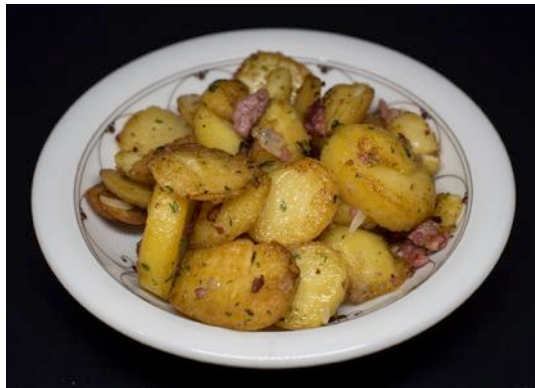
78 fried potatoes, with bacon and onions