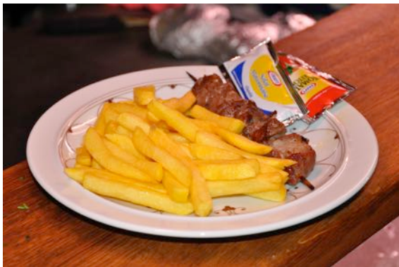
3 spit with filet of beef