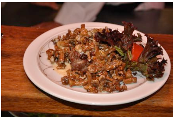
66 fillet steak (200 g) with mushrooms (chanterelles)