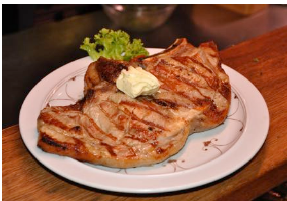
45 "Veal Saddle" (700 g), grilled double saddle with bone