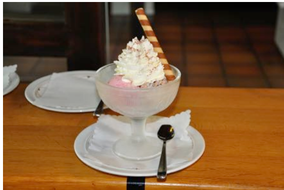
142 mixed ice cream with whipped cream