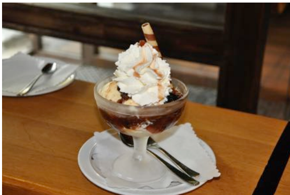
145 cup of ice cream "Gutshof Becher", vanilla ice cream with fruits in rum