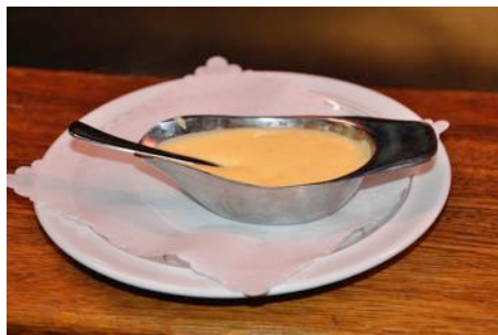
84 garlic sauce