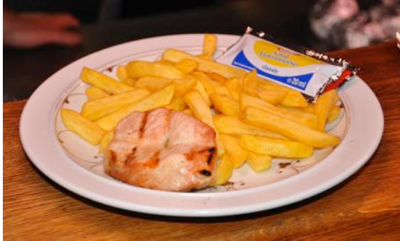
1 médaillons of turkey