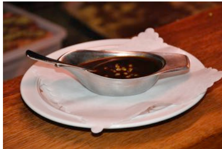
82 black pepper sauce