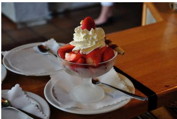
152 mousse au chocolat, ice cream, whipped cream