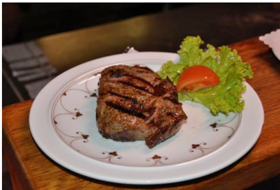
43 "American Steak" (300 g) spiced entrecôte with grease crust