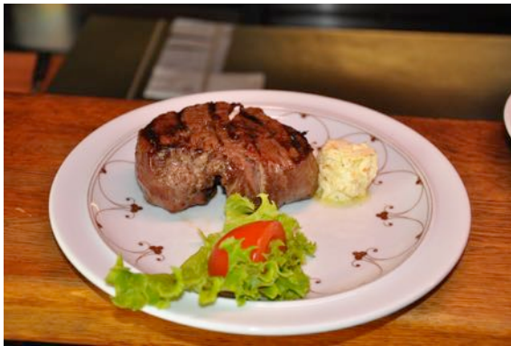
64 fillet steak (300 g)