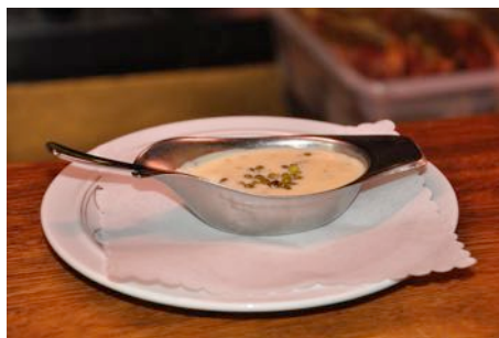
83 white pepper sauce