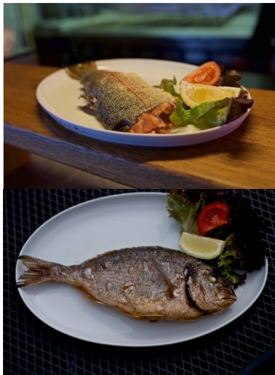
55/56 Please take advantage of our special offer of venison and fish dishes