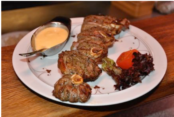
54 lamb spit "Provence" (350 g)