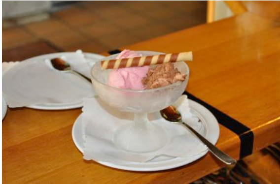
140 cup of ice cream for children