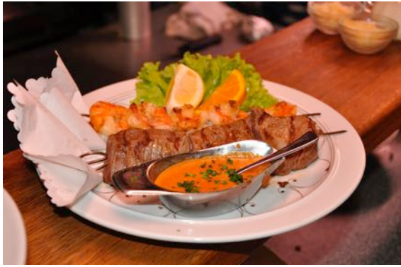
46 "Deichgrafen-Spitz" (300 g) beef-fillet, prawns and shrimps sauce