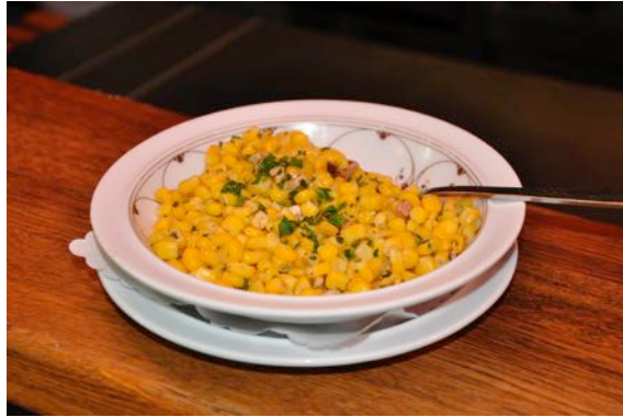
86 corn with bacon