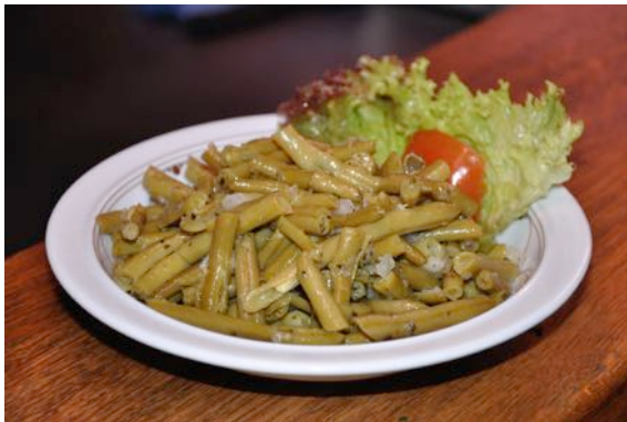
93 green beans salad