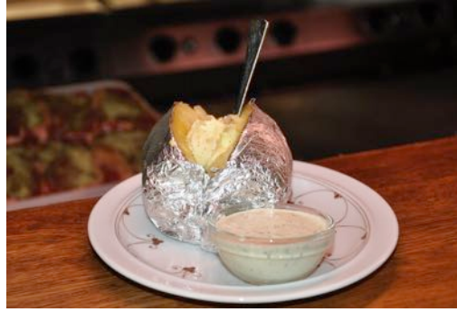
71 baked potato, herb butter and sour cream