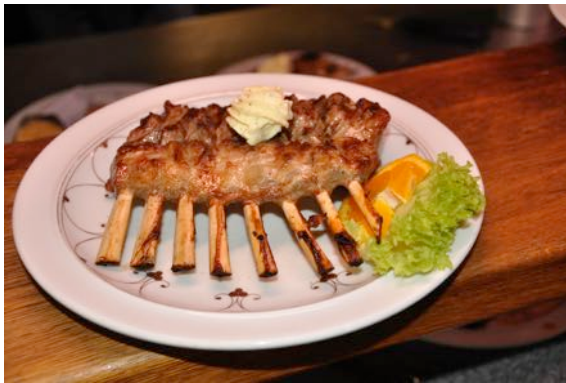
53 lamb carré, (300 g)