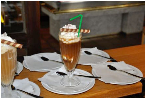
147 vanilla ice cream with hot chocolate