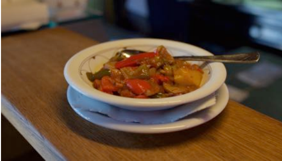
89 mediterranean vegetables