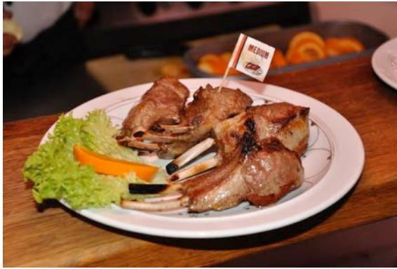
52 lamb chops, (300 g)