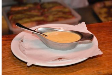
81 sauce béarnaise