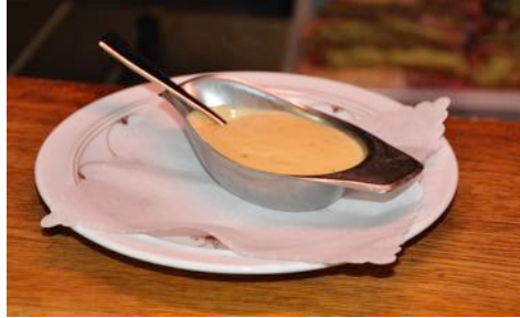
80 mustard sauce