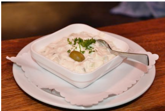
77 tzatziki, greek curd with garlic