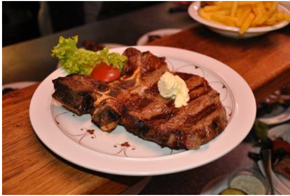
42 "Gutshofsteak" (600 g), entrecôte with bone, medium grilled