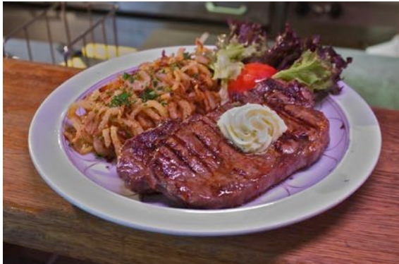
37 US beef (300 g), rumpsteak from north america