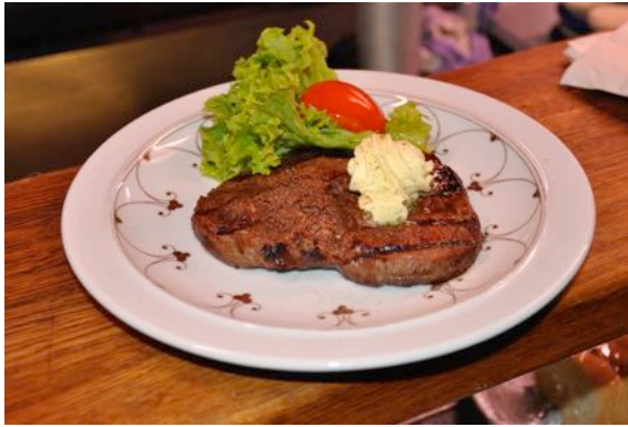
67 fillet steak (200 g) "butterfly style", well done