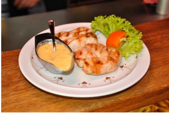
21 turkey médaillon, (200 g)