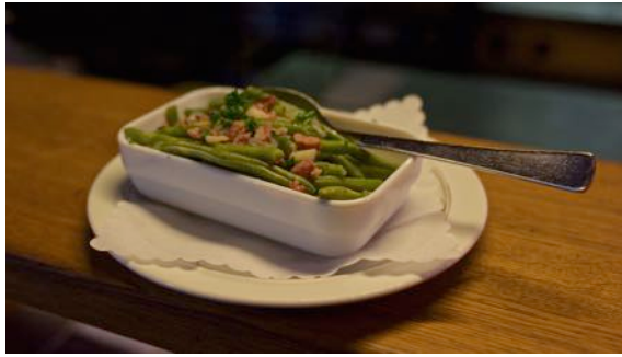
85 bush beans