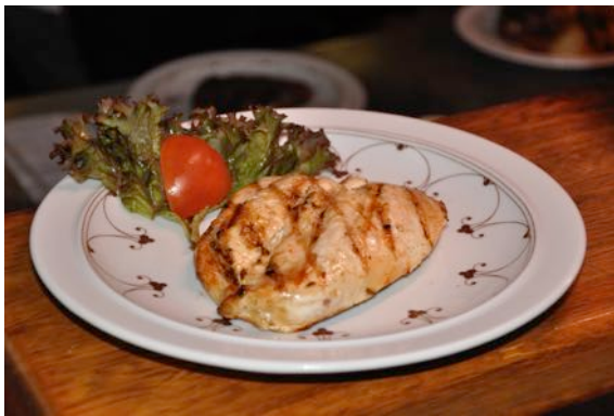
22 chicken breast, (200 g)