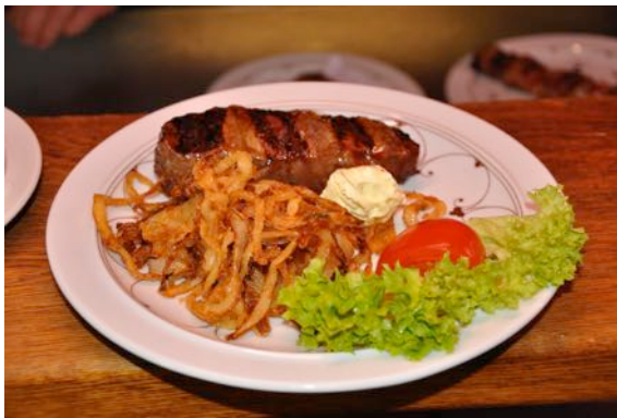
61 rumpsteak (200 g)