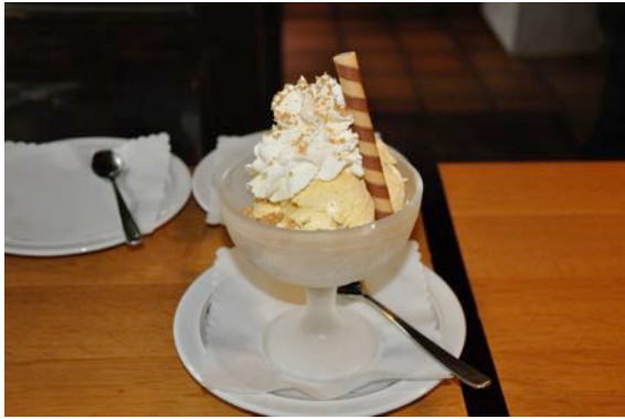
143 cup of ice cream with brittle